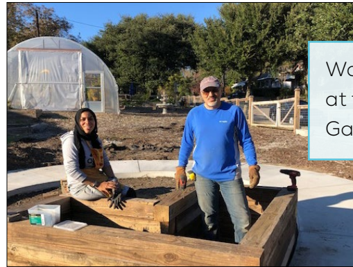
Work in progress at the Discovery Garden site!