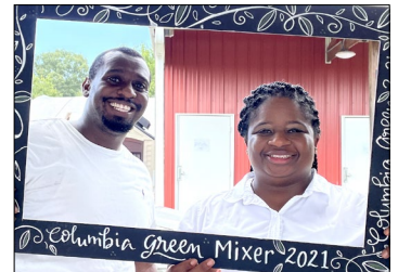
Friendly Honey River servers