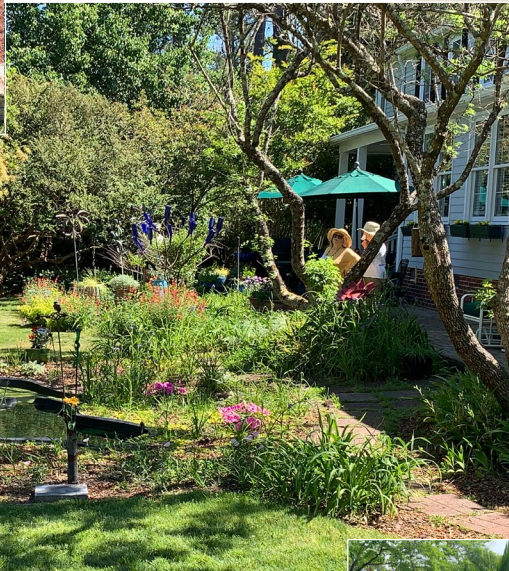
Spring Valley Road