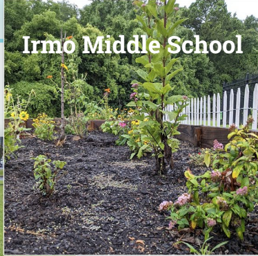
Irmo Middle School