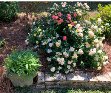
Park Shore Drive