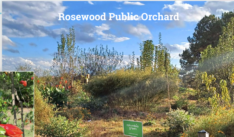
Rosewood Public Orchard

Want more Details? Click HERE to learn all about our Grants Projects!